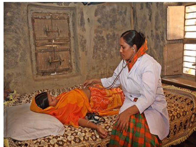
A community health worker checks a pregnant woman's health condition at her home,

7 NOVEMBER 2016 | GENEVA – The World Health Organization has issued a new series of recommendations to improve quality of antenatal care to reduce the risk of stillbirths and pregnancy complications and give women a positive pregnancy experience. By focusing on a positive pregnancy experience, these new guidelines seek to ensure not only a health pregnancy for mother and baby, but also an effective transition to positive labour and childbirth and ultimately to a positive experience of motherhood.